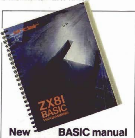
New BASIC manual

And the ZX81 incorporates other operation refinements – the facility to load and save named programs on cassette, for example, and to drive the new ZX Printer.